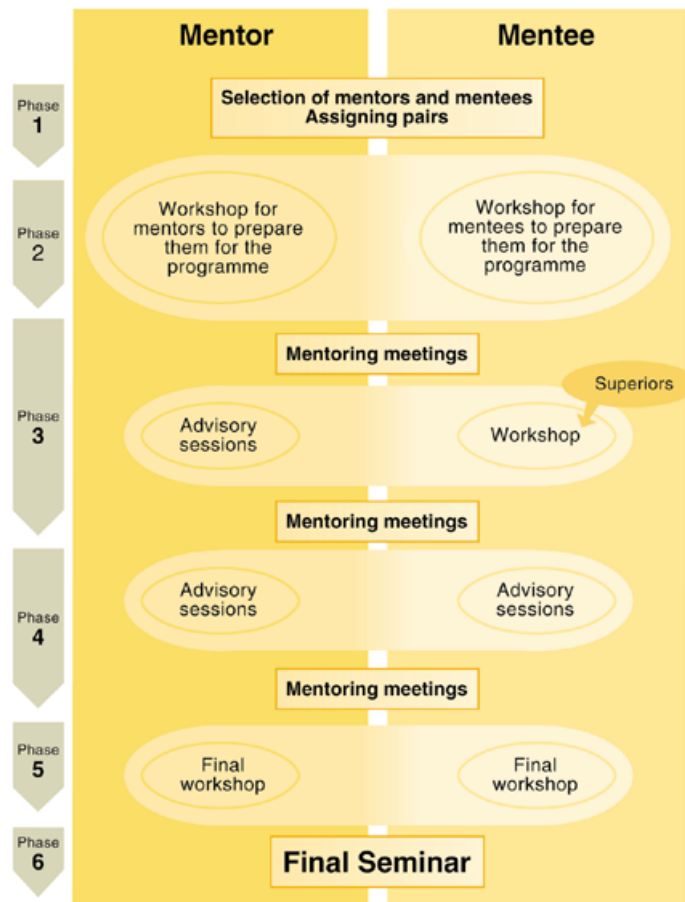
Fig. 1. Organisation of a typical mentoring programme.

will more immediately improve her situation. First of all, men—as mentors as well as superiors—get an idea 'of what it means to be a woman'. Women, in parallel, learn more about and gain access to informal networks that often are important for their career development. Last, but not least, mentors become aware of the individual strengths and skills of the